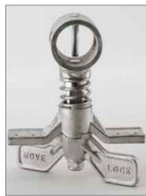
Option: Parking brake