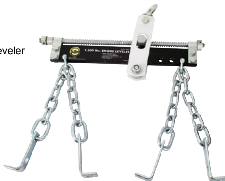
90153 Load Leveler 3/4 Ton