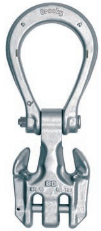
A-1362 Single Hook