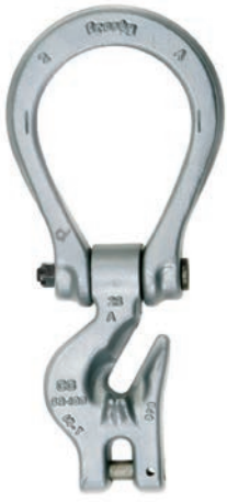
A-1361 Single Hook