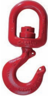
Suitable for frequent rotation under load.